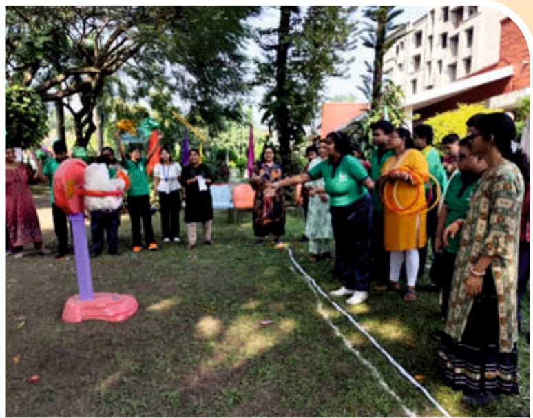
Some senior students served as cheerleaders to maintain a fun atmosphere with music