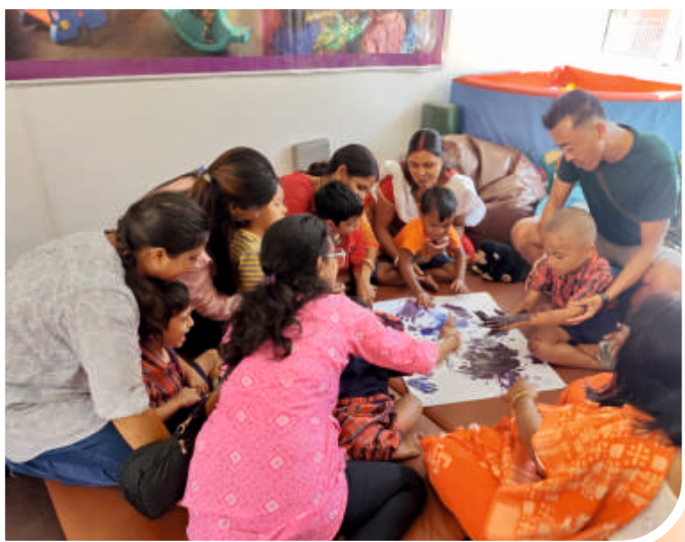
Students were engaged in the sensory classes with exposure to different sensory stimuli.