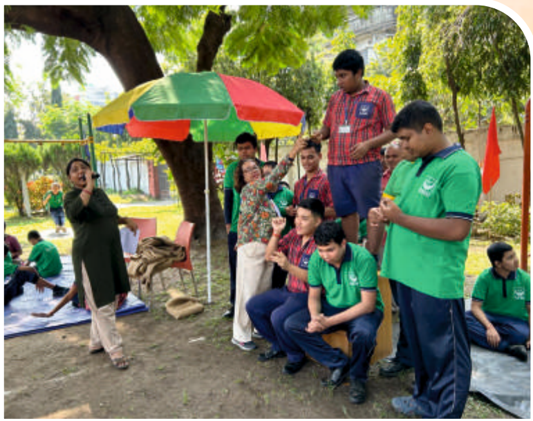
Parents of Early Intervention Unit students were involved in the class activities.